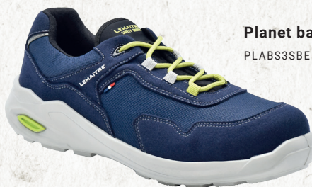
Planet bas bleu S3S PLABS3SBE