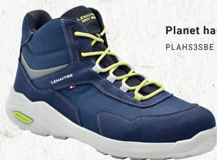
Planet haut bleu S3S PLAHS3SBE