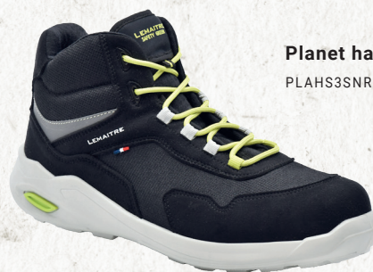
Planet haut noir S3S PLAHS3SNR